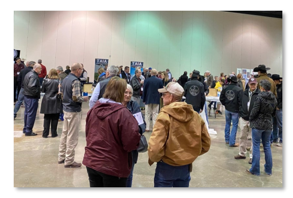
Attendees during a break, visiting the booths and sponsors.