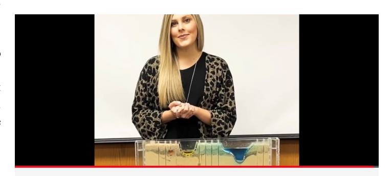
Panhandle Groundwater Conservation District's Education Program

The 12-minute video can be found on PGCD's YouTube Channel. This video is a great tool for educators and parents to utilize during this time to introduce water conservation or to freshen up on some water conservation tips.